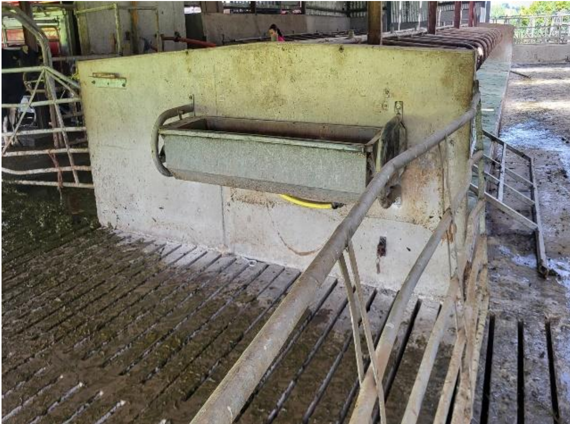
Fig 6. Raised drinker to facilitate the access by robotic scraper