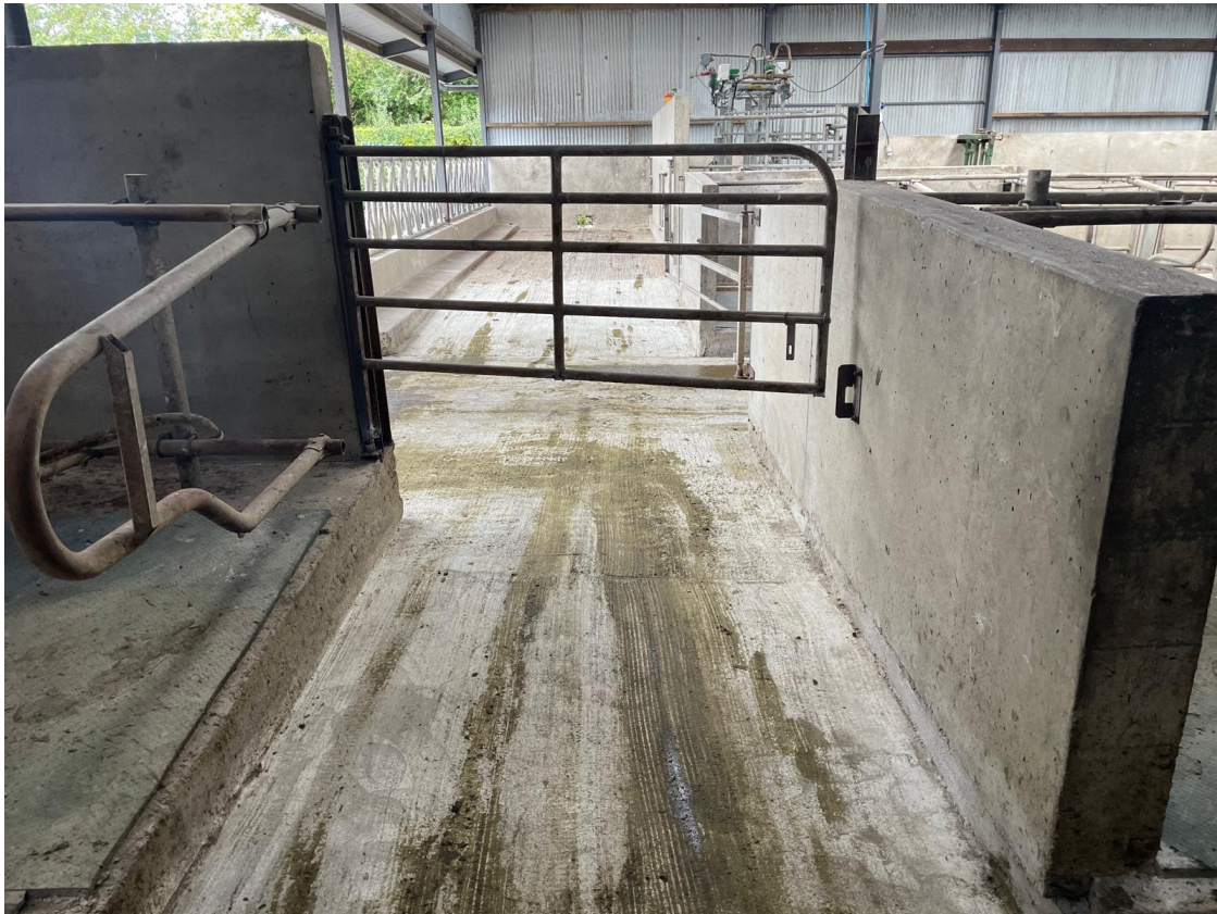
Fig 7. Raised gates requiring specific fabrication to facilitate scraper movement