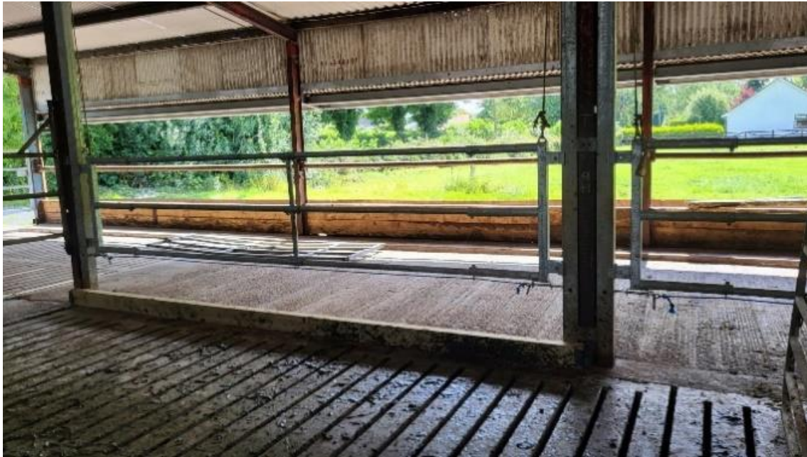
Fig 5. Passageway separated via installed barrier bolted to plates welded into place to reduce the size of the passageway.