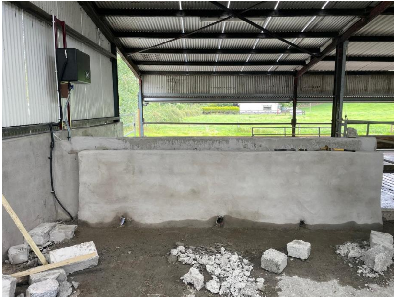
Fig 9. Structural work required to install Lely Discovery scraper