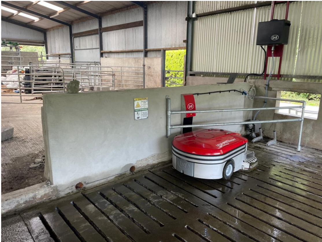
Fig. 10 Permanent structural area needed to facilitate charging, water refilling and deposition of manure