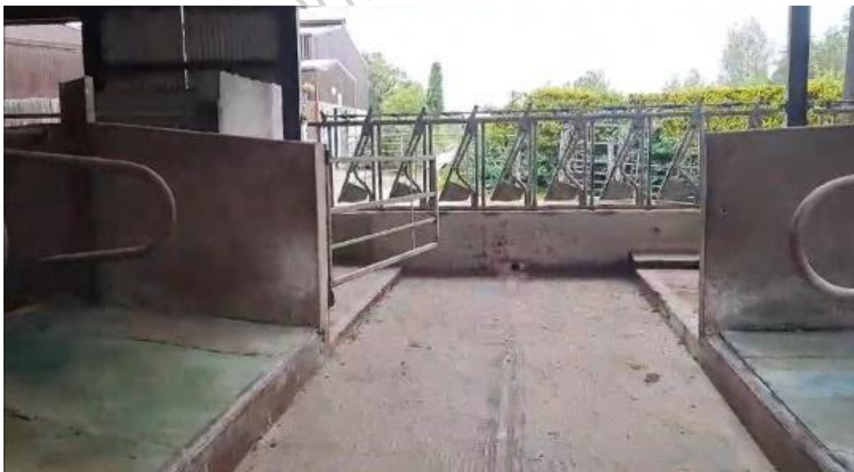
Fig 1. Existing passageway with steps to either side. These had to be removed and entirely new concrete passageways laid

In addition, the guidance document states that robotic scrapers are not integrated within the farm building. As the above clearly shows this is not accurate. The unit itself is inseparable from the permanent installation of the charger and associated equipment (eg separation fence, boundary modification, sump etc).