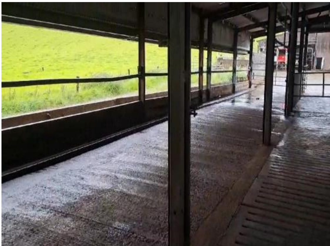
Fig 4. Passageway of over 5m, too wide for robotic scraper