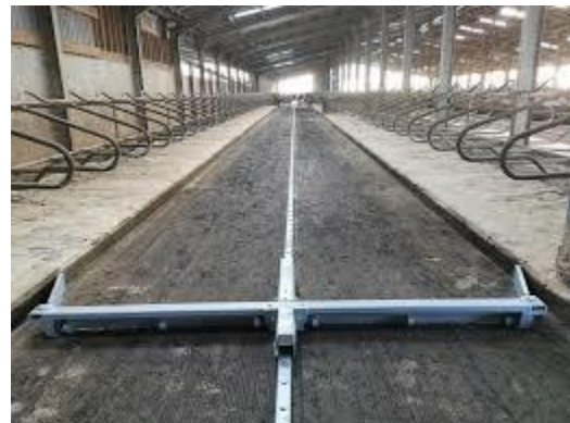
Traditional automatic hydraulic scrapers