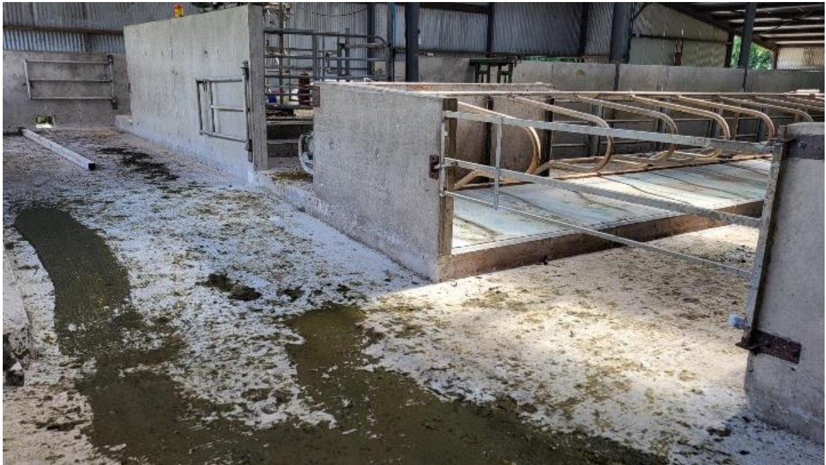
Fig 3. New passageway demonstrating the change in height and significant changes needed to accommodate the scraper.