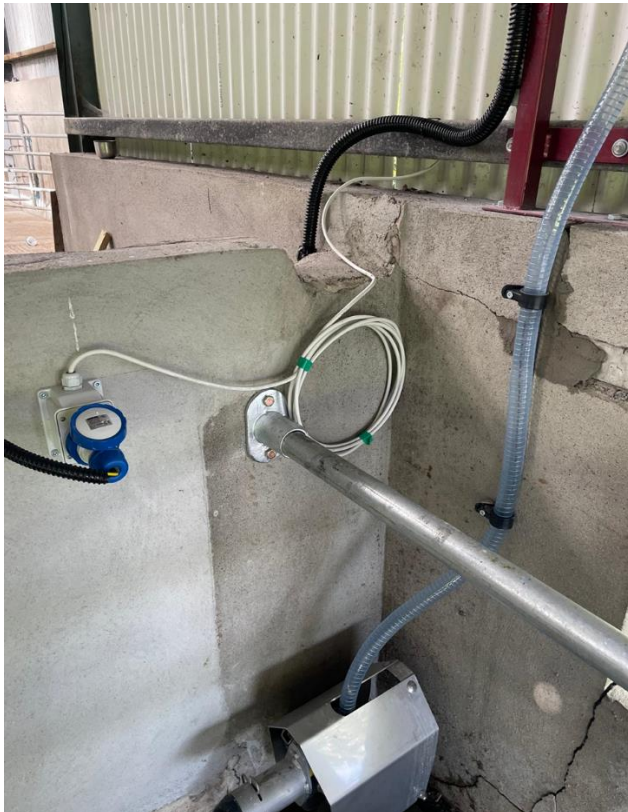
Fig 11. Installation of wiring and permanent water source for scraper units