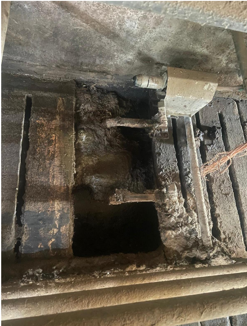
Fig 8. Specifically build sump for Lely Discovery Collector to deposit collected manure.