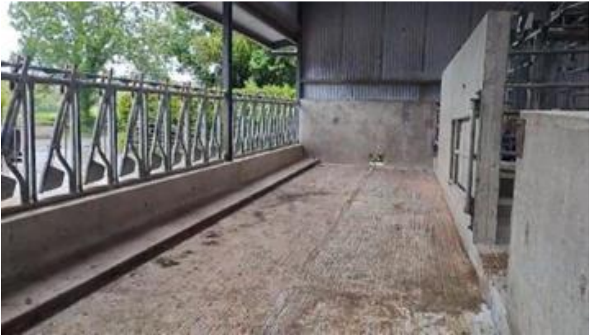
Fig 2. New passageway laid complete with step to guide scraper (near feed barrier)